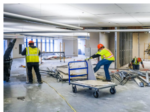
Construction crews work to restore the building.