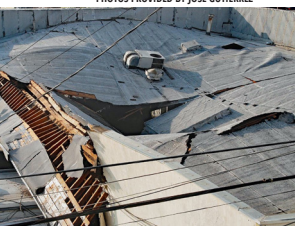
Photos depict the damage to the building due to the wind, rain, and snow storm of November 2019.