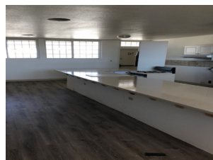
The new, fully functional fellowship hall kitchen: ready for use.