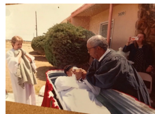
Facility and pandemic challenges didn't stop God's work.