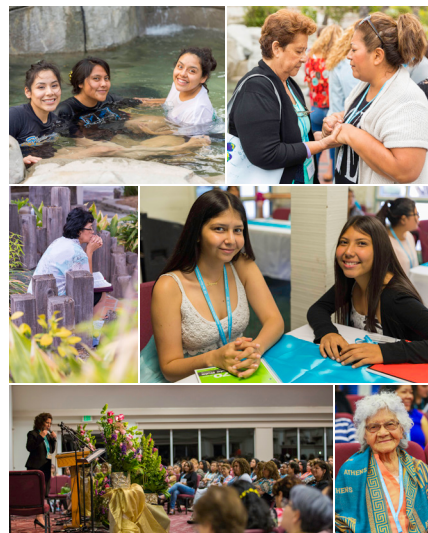
Women at the 30th annual Hispanic Women's Ministries retreat.