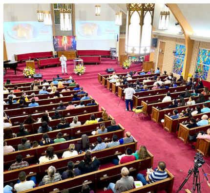
The church was fully attended each night.